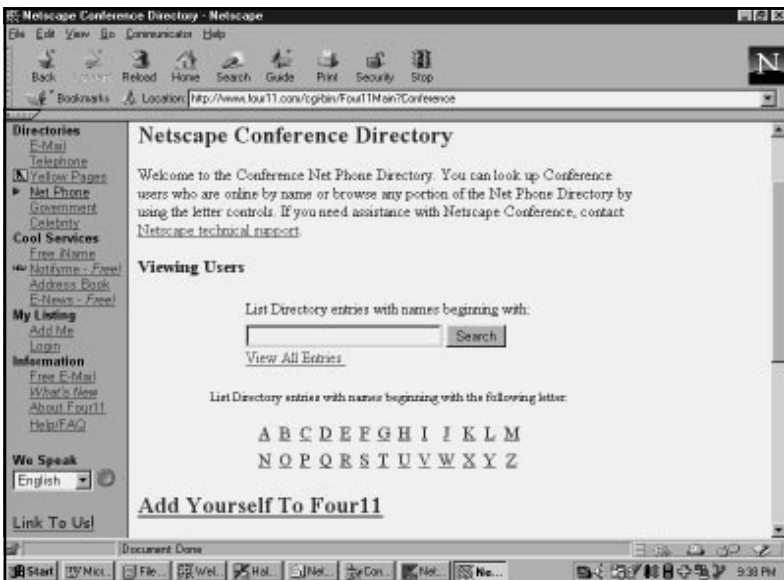
FIGURE 15.2 Netscape Conference Directory.