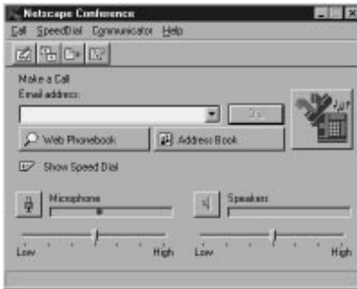
FIGURE 15.1 The Netscape Conference window.