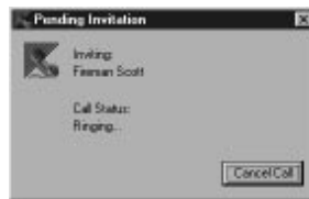
FIGURE 15.3 The Pending Invitation dialog box.