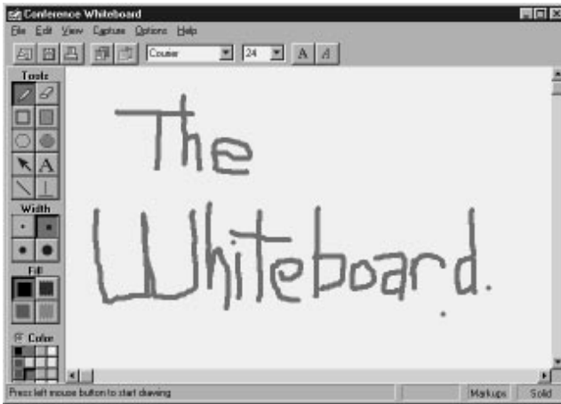
FIGURE 15.5 The Netscape Conference White Board window.